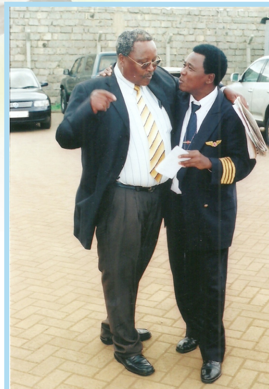
KALPA SPECIAL CONFERENCE 24th Nov, 2009.